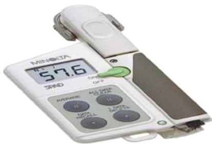
Figure 4. Chlorophyll meter

The SPAD-502 chlorophyll meter is a hand-held equipment that is used for the quick, precise and non-damaging measurement of leaf chlorophyll content. It is widely used in both research work and in agricultural applications on different plant species [16]