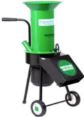
Figure 5. Organic shredder

handles kitchen waste. The shredder has a hopper, with a protective bar and a specific opening. In addition, it has a pair of wheels and a handle, which make it portable and navigable. The shredder is easy to use. It is simply turned on with a quick switch and in a moment, the waste is turned into organic chips.