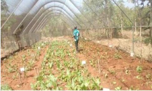
Figure 3. Swiss chard under shade net