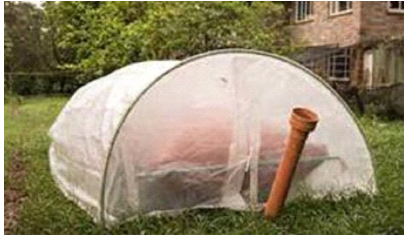
Figure 2. Flexi bio digester

fermentation and gas release. It is then piped via PVC pipe connected to a stove for cooking. The flexi biogas digester does not require an agitator and it is simply a 6 m x 3 m envelope made of PVC canvas and housed in a fabric tunnel. It is simple and easy to operate [46].