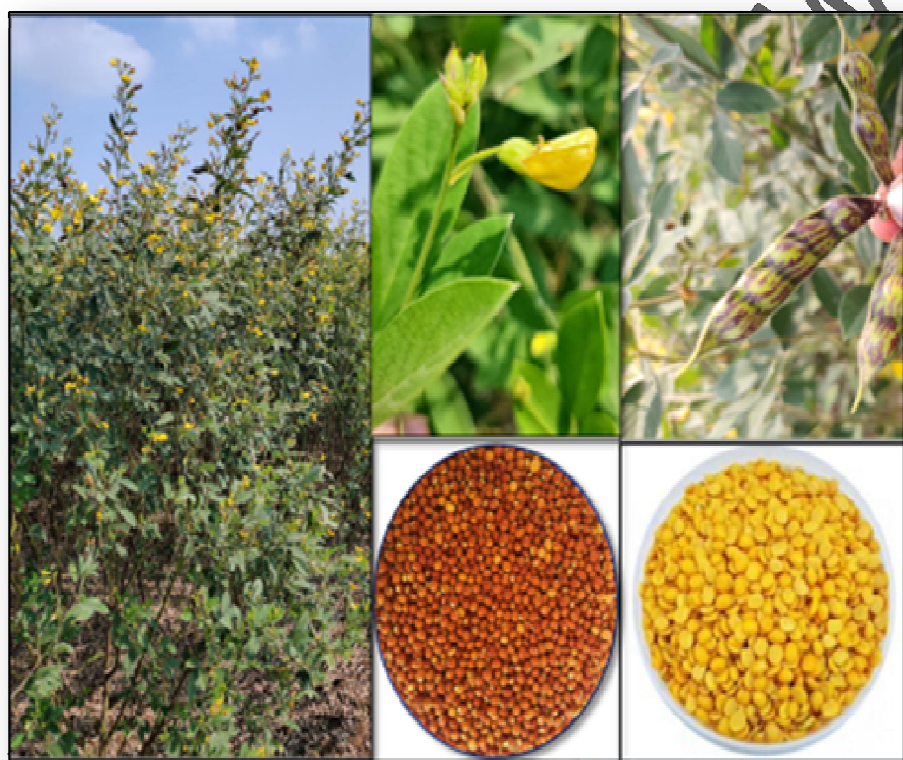
Figure 2:Plant, Flower,Pod, Seed and Dal of TDRG 59

Comment [S5]: Title should be below the figure