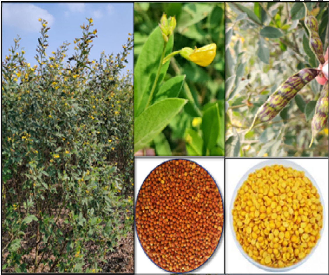
Figure 2:Plant, Flower,Pod, Seed and Dal of TDRG 59

The culture is described as tall plant type(170cm-210cm),indeterminate growth habit, semi spreading nature with the branches arising from the stem base, green stem,oblong leaves, yellow flowers with light redstreaks on the standardpetal, dark green pods with purple streaks, waxy and sticky podwall,three seeds_per pod and bold brown globular seeds with test weight (100 seed weight) of 11.4 -11.9 g(Fig.2).