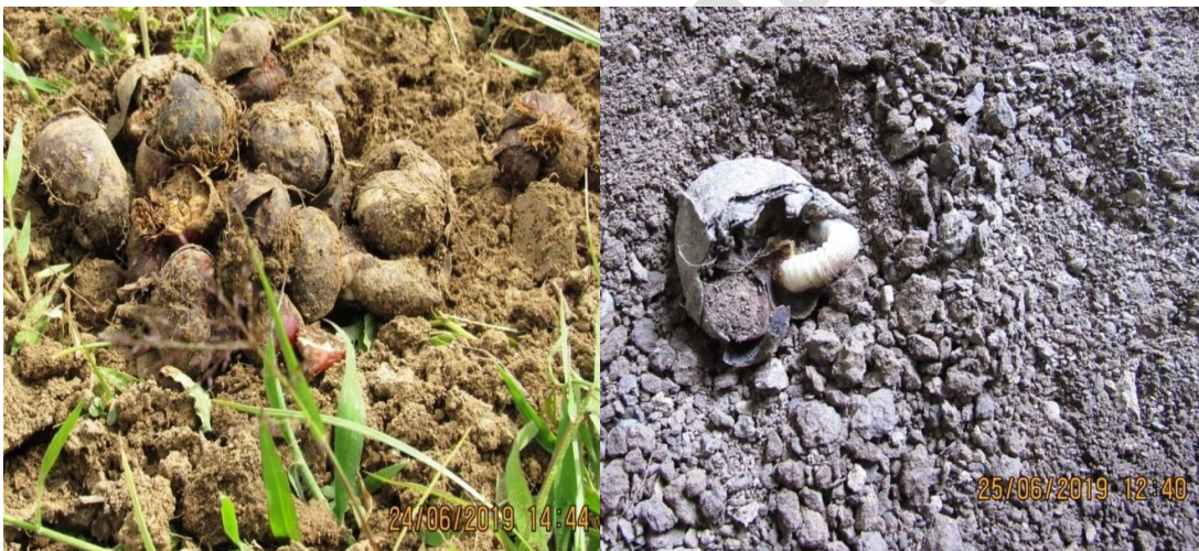
Plate 2. Tulip bulbs infested with white grub