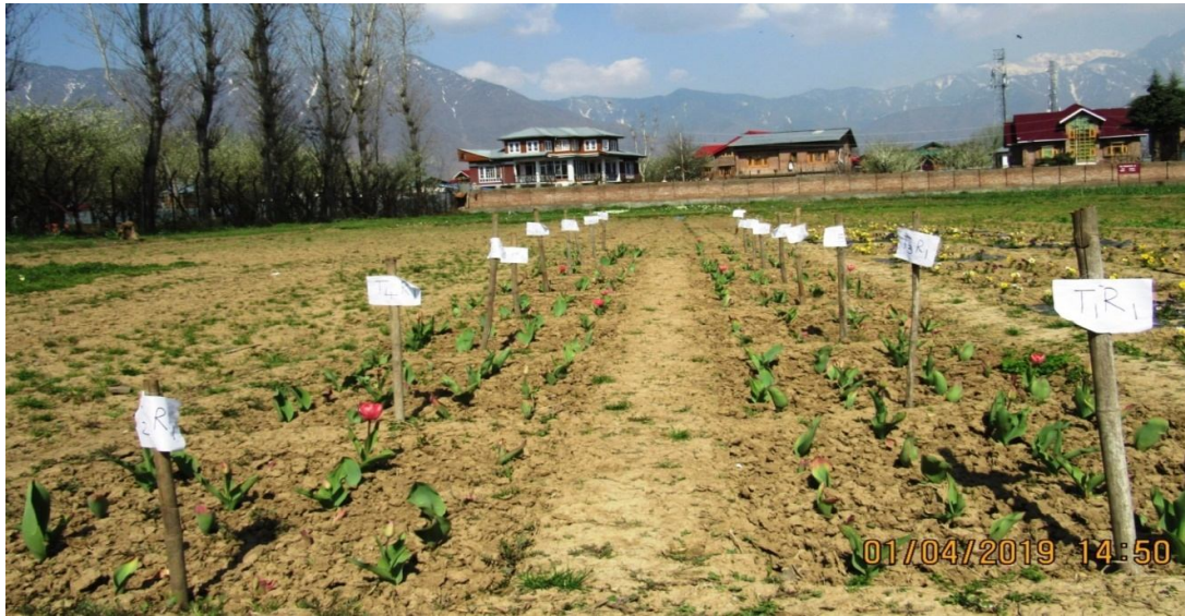
Plate 1. Experiment on bio-efficacy of some granular insecticides against soil arthropods in tulip ( Tulipa gesneriana ) at Urban Technology Park, Habak,SKUAST-K