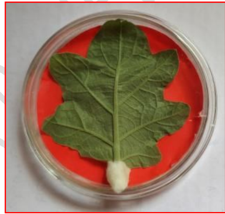
B. Mass culture