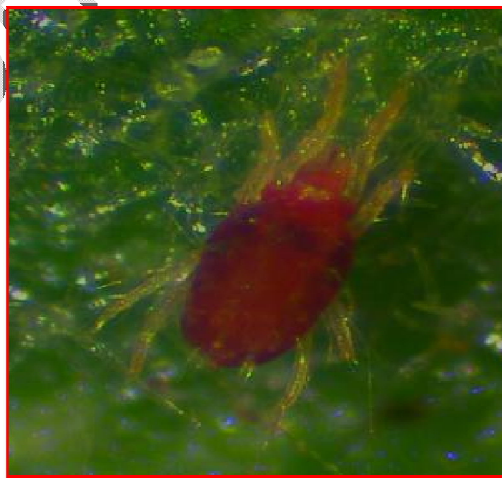
Teleiochrysalis(Between duetonymph and adult stage)

Plate III: Resting life stages of T. urticae