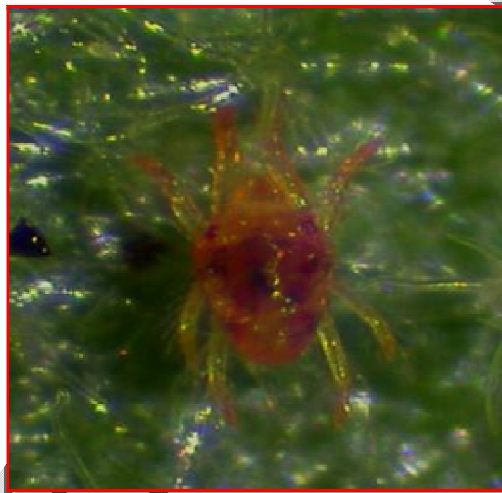
Deutochrysalis(Between protonymph and duetonymphal stage)