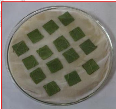
C. Leaf bit rearing technique