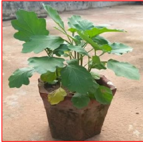
A. Mother culture