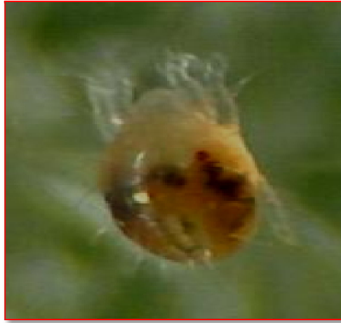
Nymphochrysalis(Between larva and protonymphal stage)