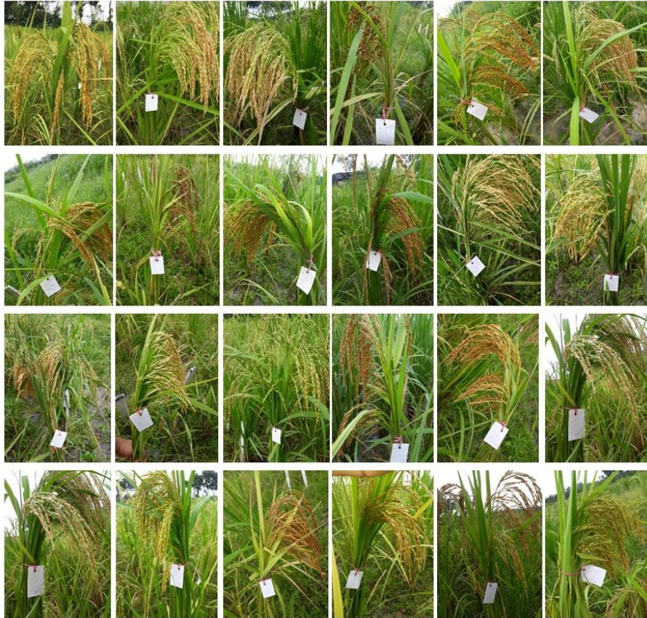
Figure 2(A). Panicle length, grain number in panicle, grain color and shape variability observed in F 2 generation of Aus rice. (Please label properly so that it is self explanatory, only the photos are shown which generation, parental genotype name etc should be mentioned.)