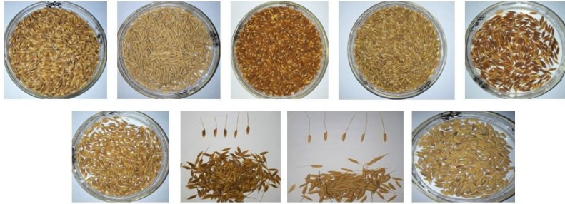
Figure 1. Grain color and shape variability observed in parental generation of Aus rice. (Please label properly so that it is self explanatory, only the photos are shown which generation, name etc should be mentioned.)