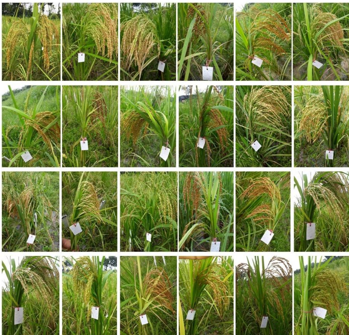
Figure 2(A). Panicle length, grain number in panicle, grain color and shape variability observed in F 2 generation of Aus rice.