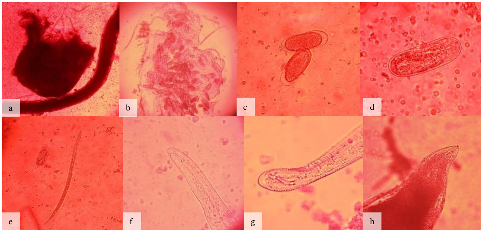
Figure 2: Nematode: The egg mass of M. incognita looks broken and produces J2 (a). Condition of eggs of Meloidogyne spp. in the egg mass (b). Egg of Meloidogyne spp. (c). J1 in egg (d). Egg size difference J1 and J2 (e). Basal knob on male (J2) Meloidogyne spp. (f). Anus J2 (g). Basal knob on female Meloidogyne spp. (h).