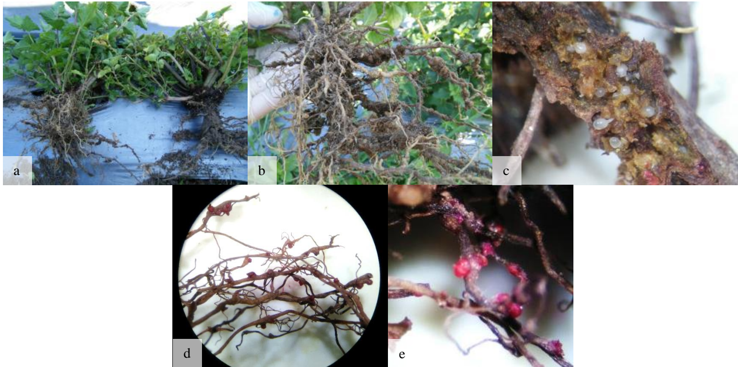
Figure 1: Nematode infestation. The Misai kucing plant on the left side has normal leaves, and the root hairs are still abundant in the primary root main stem. In contrast, the Misai kucing plant on the right side shows small leaves with little root hairs remaining on the primary roots, showing a severe nematode attack (a). Root galls can be observed clearly from this photo (b). Adult female of Meloidogyne spp. and egg masses under stereo microscope (c). Egg masses on misai kucing roots turn red after staining with Phloxine B (d). A close-up view of egg masses (red) of Meloidogyne spp. attach on roots (e).