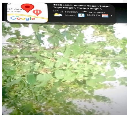
Image-1. Location for plant sample collection