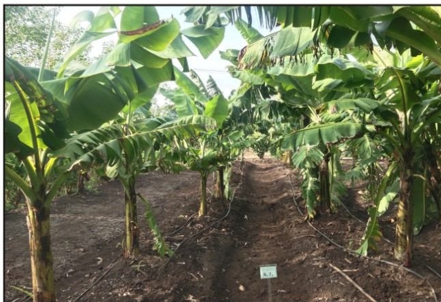
T 4 -2.4×1.8 m – (Single row)