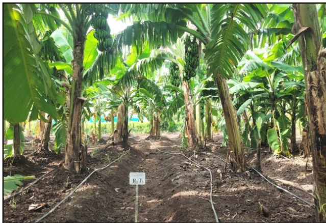
T 3 -2.1×1.8 m – (Single row)