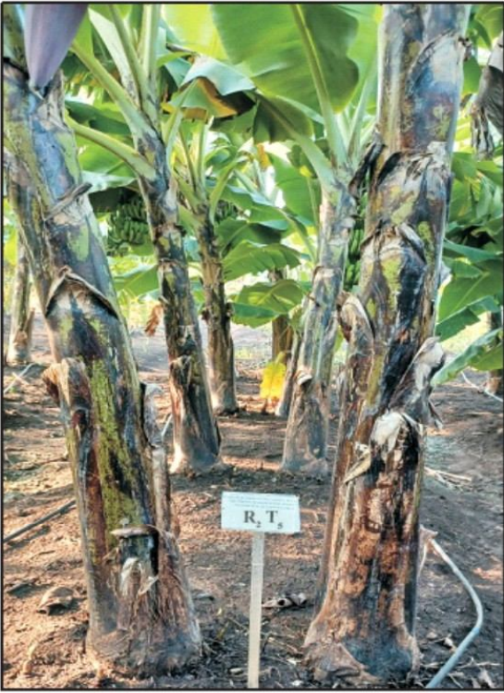
T 5 - 2.4×1.8×0.3 (2 plants/hill)