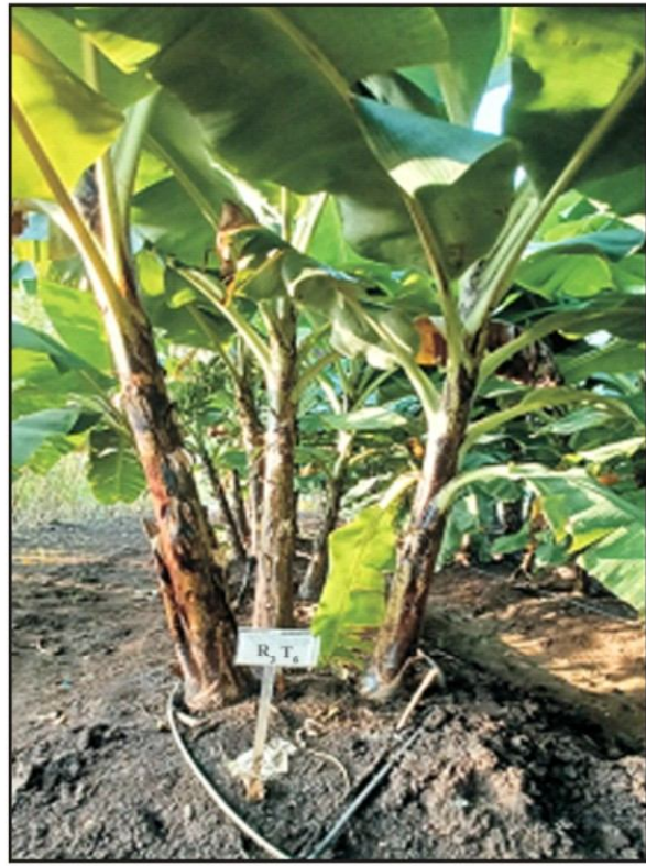
T 6 - 2.7×1.8×0.3 (3 plants/hill)