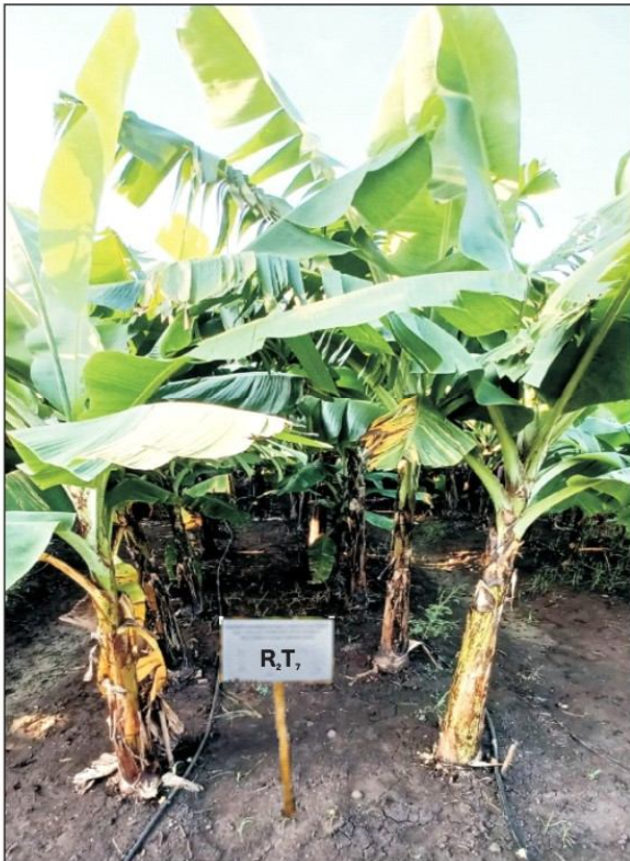
T 7 -2.4×1.2×1.0m (Paired row)