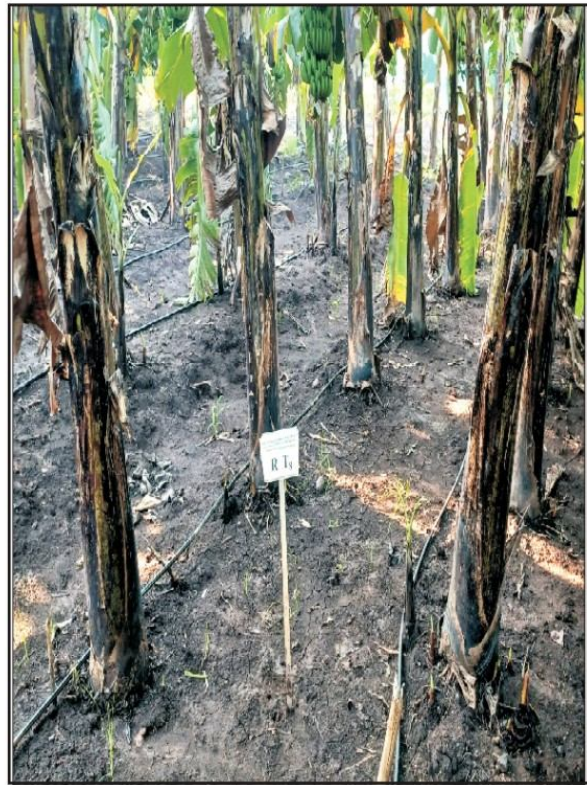
T 8 -2.1×1.2×1.2m (Paired row with Zig-Zag)