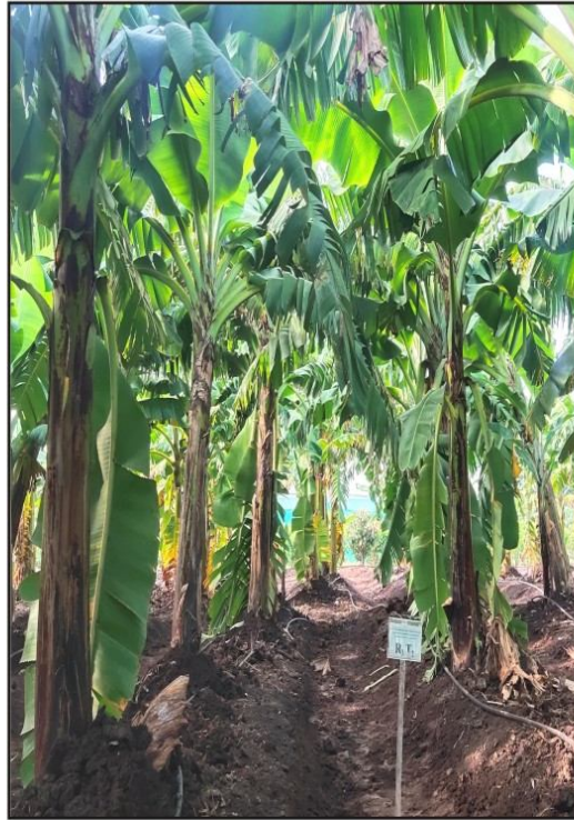
T 2 -1.8×1.8 m (Single row)