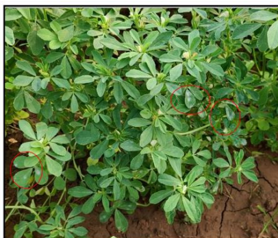
Fig 2. Initiation of powdery mildew disease on fenugreek leaves