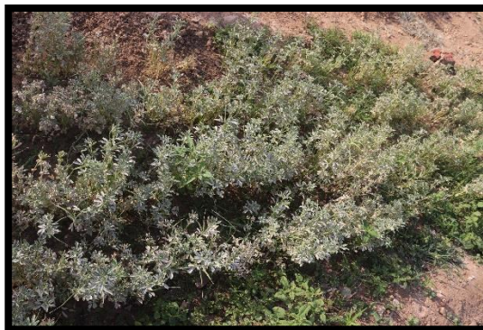
Fig 7. Effect of Control (No spray) against powdery mildew disease