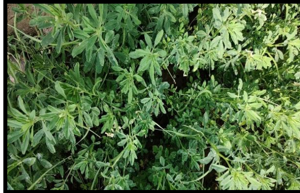
Fig 5. Effect of three spray of Hexaconazole 5 % EC @ (0.005%) @ 10 ml/ 10 lit against powdery mildew disease