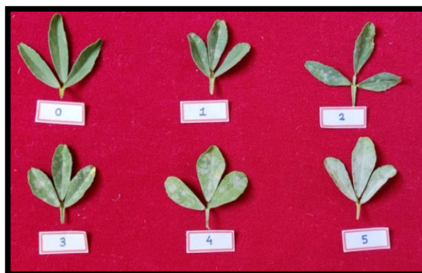
Fig 1. Leaf area affected by powdery mildew disease (0-5 scale)