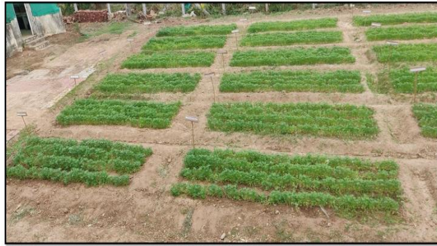
Fig 4. Field view of fenugreek powdery mildew