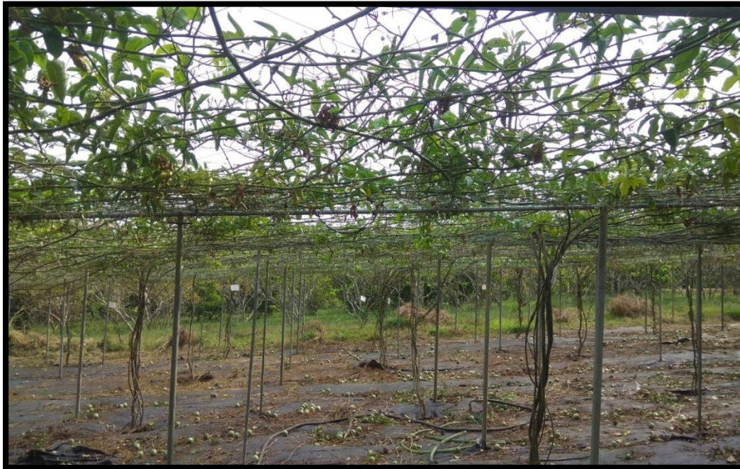
Fig.1. Passion fruit plot after pruning