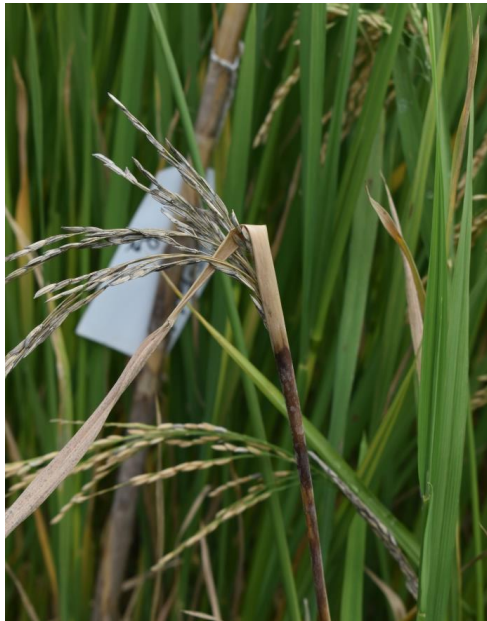
Plate 1: Scoring of sheath rot by using 0-9 scale