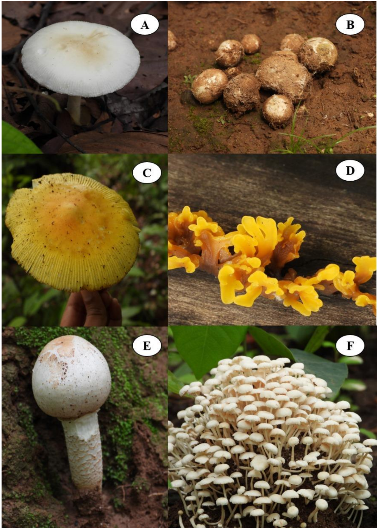
Plate 1: Some common wild edible mushrooms of RFD, A) Amanita egregia , B) Astraeus hygrometricus , C) Amanita caesarea , D) Dacryopinax spathularia , E) Termitomyces heimii , F) Termitomyces microcarpus