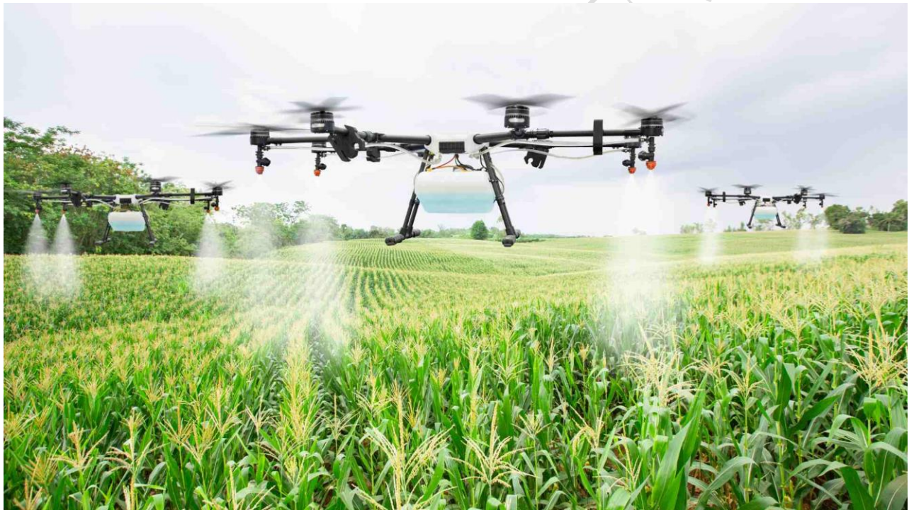
Fig 2. Drone Technology in Agriculture

Compared to human aerial surveys or other traditional techniques, drone data collecting is more affordable. Because of its accessibility, farmers of all sizes may use this technology, democratizing the advantages of precision farming.