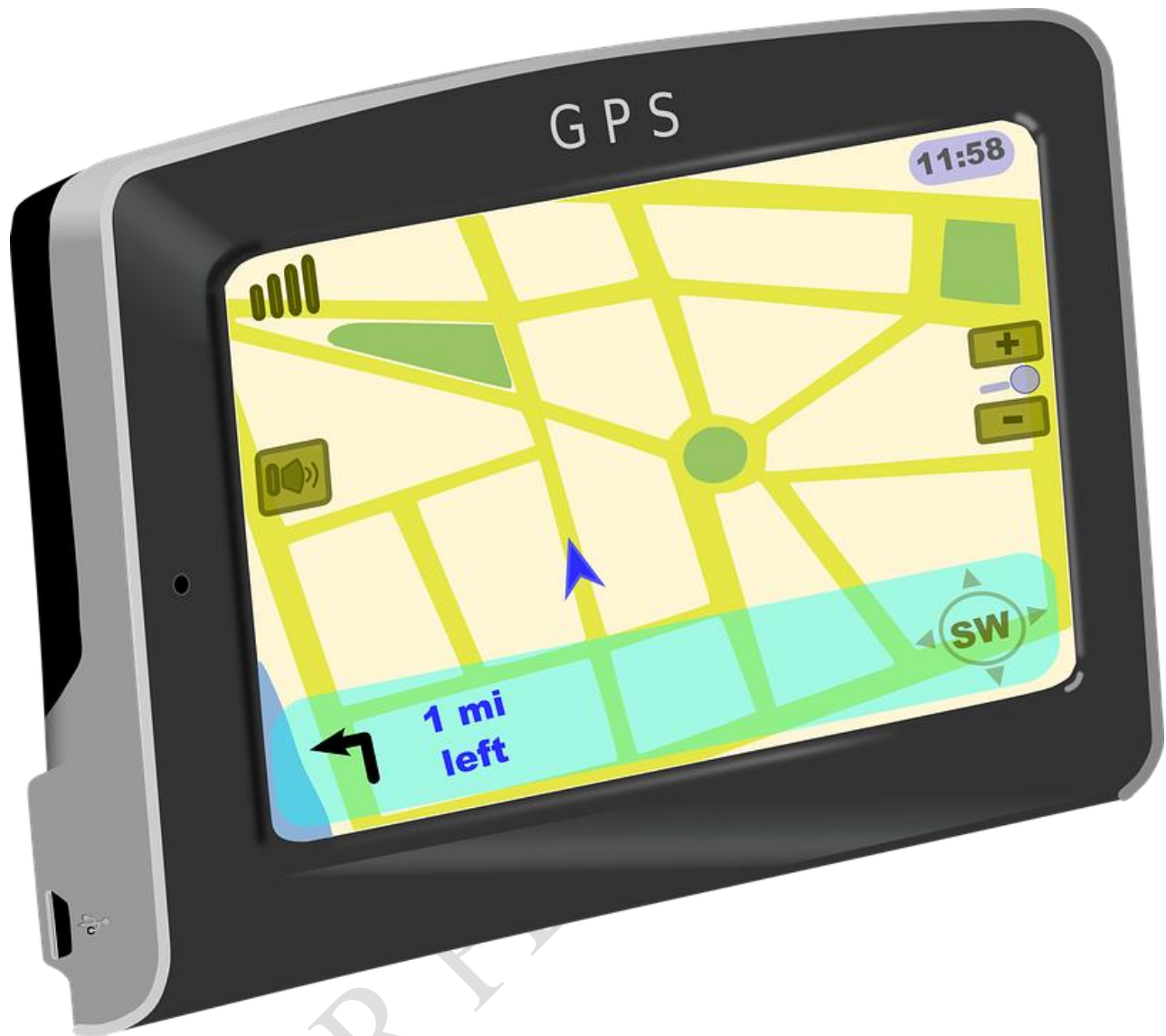
Fig 1. Unmanned Aerial Vehicles (UAVs) And Drones In Precision Agriculture

UAVs equipped with multispectral cameras can capture high-resolution imagery and data of farm fields. They're particularly useful for monitoring crop health, detecting pests and diseases, and spraying pesticides or fertilizers in a targeted manner. This section explores the role of drone technology in agriculture, emphasizing its applications in aerial imaging and mapping, crop scouting and monitoring, and the integration of artificial intelligence (AI) to enhance functionality.