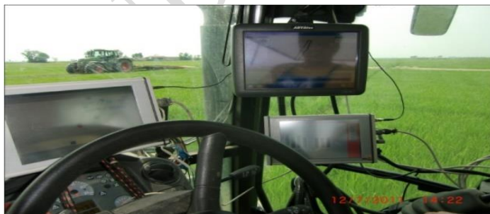
Fig 4. Yield Monitors for Precision Agriculture

Finding fields with greater or lower yields is made easier with the use of GPS-enabled yield monitoring. This data can direct more research into the variables generating variability, allowing for more focused treatments aimed at improvement.