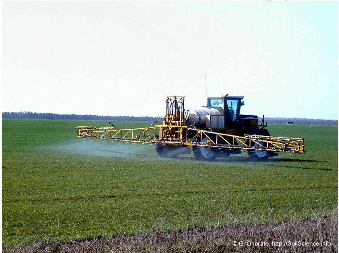
Fig 3. Variable Rate Technology (VRT)

Depending on each area's unique crop requirements and soil qualities, VRT is utilized to plant seeds. This aids farmers in maximizing crop quality and yields Eastwood et al. , 2017.