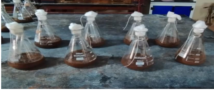
Figure 1. Incubation of treated and non-treated samples in replicates