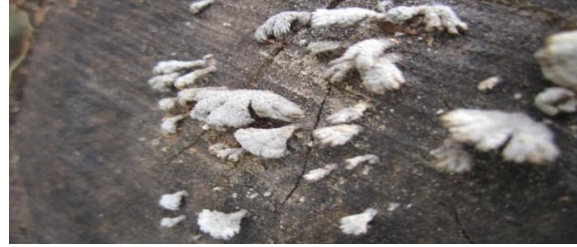
PLATE 4: Auricularia polytricha on Parkia biglobosa (4x)