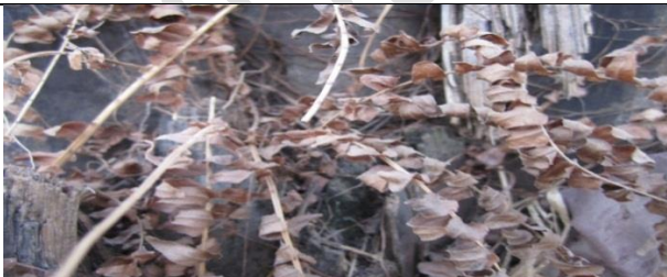
PLATE 10: An annual epiphytic plant Nephrolepis biserrata drying on Parkia biglobosa to sprout out in the next raining season (4x)