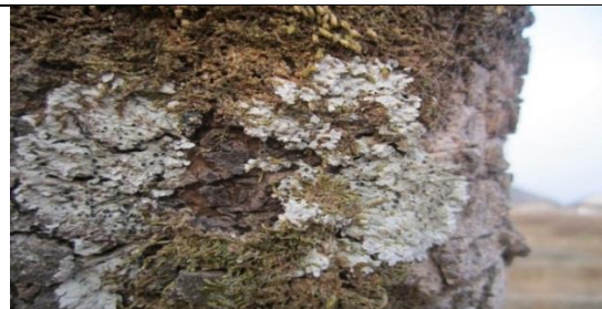
PLATE 19: Lycoperdon spadiceus and Daldinia cocentrica on Parkia biglobosa (4x)