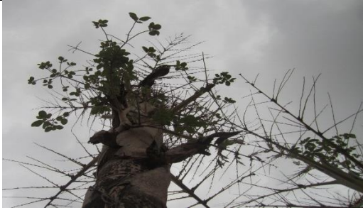
PLATE 5: Ficus leprieurii on Copernicia prunifera (4x)