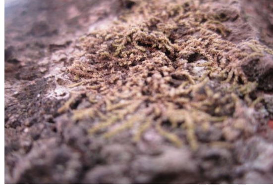
PLATE 13: Syntrichia laevipila on Parkia biglobosa (4x)