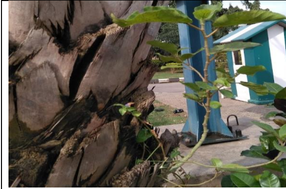
PLATE 26: Ageratum conyzoides and Ficus sp on the bark of Roystonea regia (4x)