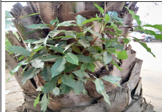
PLATE 28: Ficus aurea on Elaeis guinensis (4x)