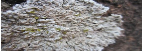
PLATE 3: Daldina concentrica on Vetillaria paradoxi (4x)