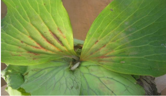
PLATE 12: Sporophyte phenological phase of Platycerium stemaria on Parkia biglobosa (3x).