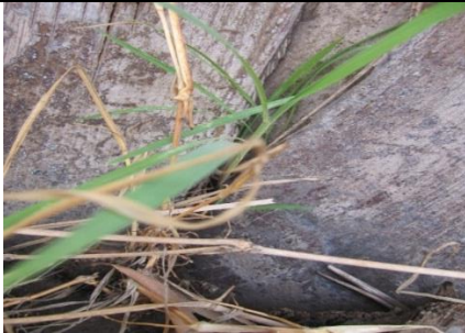
PLATE 22: Lichen on back of Elaeis guinensis covered by a Digitaria sp (4x)