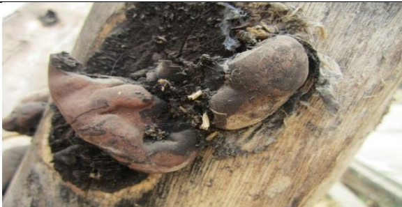
PLATE 14: Frullania dilate on Polyandra longiflora of Parkia biglobosa (4x)