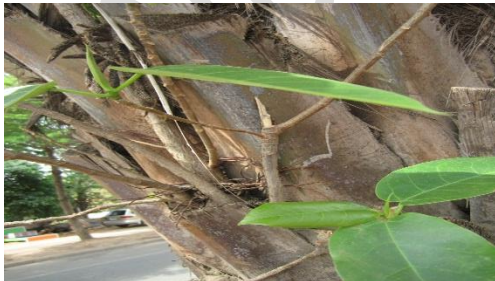
PLATE 1: Ficus thonningi on Elaeis guinensis (4x)