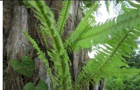
PLATE 23: Nephrolepis undulata and Ageratum conyzoides on Elaeis guinensis (4x)