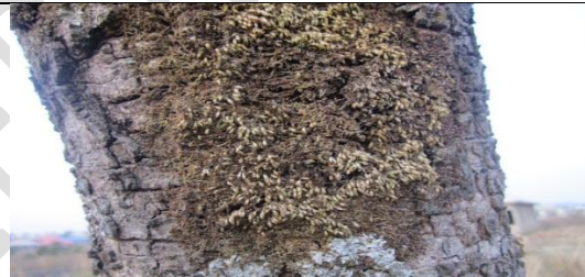
PLATE 8: Patches of Funaria sp and lichen on Parkia biglobosa (4x)