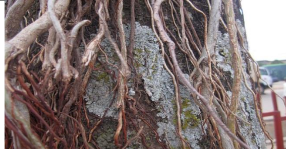
PLATE 6: Epiphytes roots on the host tree with patches of lichens and mosses (4x)