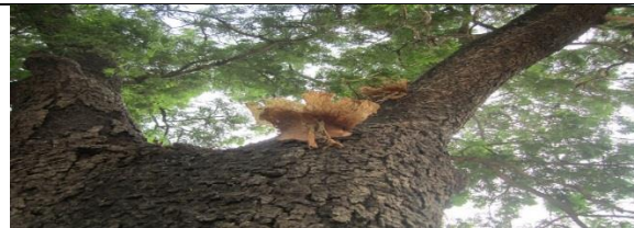
PLATE 11: Platycerium stemaria drying on Parkia biglobosa after a complete sporophyte cycle awaiting the next wet season for the gametophyte phase of the alternation of generation life cycle (3x). Source: Field work