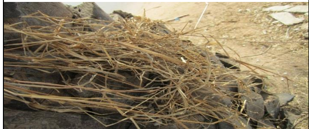
PLATE 2: Elaeis guinensis persistent old frond serving as a conservative reservoir of epiphyte propagules of annual grass till the next raining season (4x).