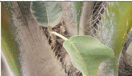
PLATE 18: Ficus benghalensis on Elaeis guinensis (4x)