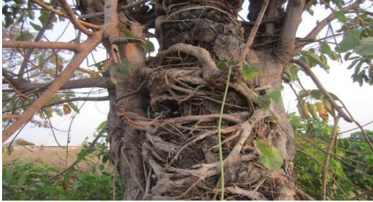
PLATE20: Ficus sp , mosses and lichens on Ficus sp on Ficus sp (4x)