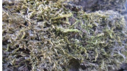
PLATE 21: Plagiothecium undulatum on khaya senegalensis (4x)