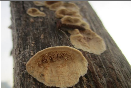
PLATE 7: Coprinus lagopus on a dead trunk of Vetillaria paradoxa (4x)