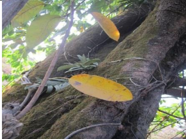
PLATE 24: A community of epiphytes on a host plant Syzygium sp . Mosses, Ficus sp . on Calyptrorchium emarginatum and Cyrtorchis sedeni (4x)