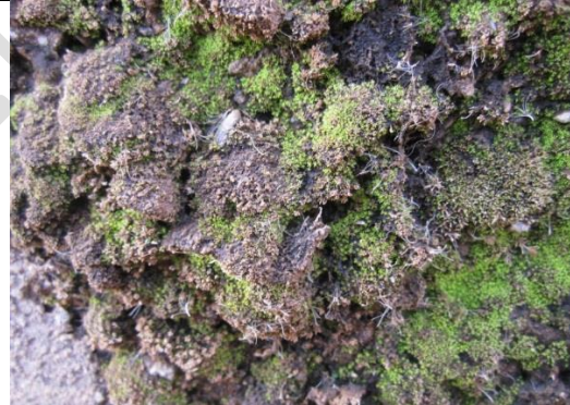
PLATE 25: Entodon sp on Vitex doniana (4x)