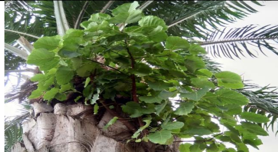
PLATE 27: Viburnum tinus on Elaeis guineensis (4x)