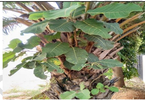
PLATE 29: Ficus benghalensis on Elaeis guinensis (4x)

The epiphytes were classified based on their mode of life as shown in Table 2 below. Some epiphytes were Typical Epiphytes while others were Semi Epiphytes and Occasional Epiphytes.