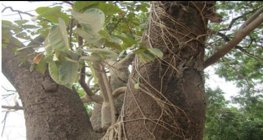
PLATE 16: Ficus vogelli on Parkia biglobosa (4x)