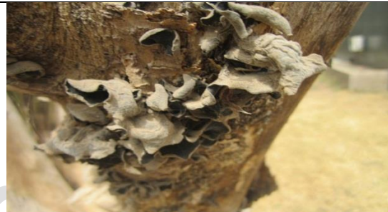
PLATE 15: Fomitopsis sp on Vitex doniana (4x)