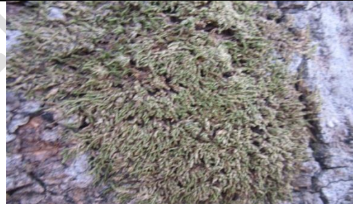
PLATE 17: Lycoperdon spadiceum on Albizia lebeck (4x)