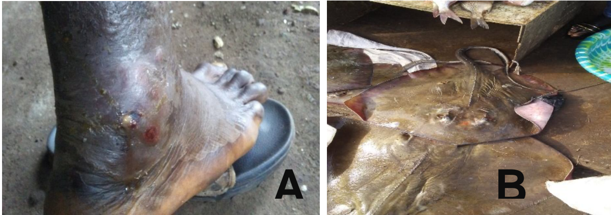
Figure 1: abscessed erysipelas of the right foot in a 25-year-old fisherman (A), caused by stingray (B) in an artisanal fishing port in Conakry