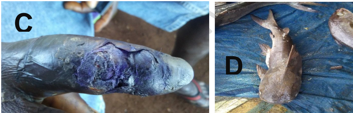
Figure 2: gangrene of the right index finger (C) in a 45-year-old fisherman, caused by a bite from a stingray (D) in an artisanal fishing port in Conakry.