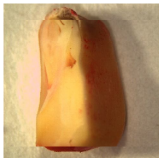
Figure 1. Tetrazolium staining pattern of grain corn seeds (Left - Seeds were viable when the living embryo tissues stained red; Right - Non-viable when seeds remained unstained or white)