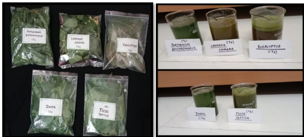
Plate 1 Preparation of plant-extracts for treatments

1971) (Plate 1). All the treatments were given as foliar sprays. Plant-extracts were sprayed @ 1 and 10 ml/litre of water, mancozeb @ 2 ml/ litre of water.