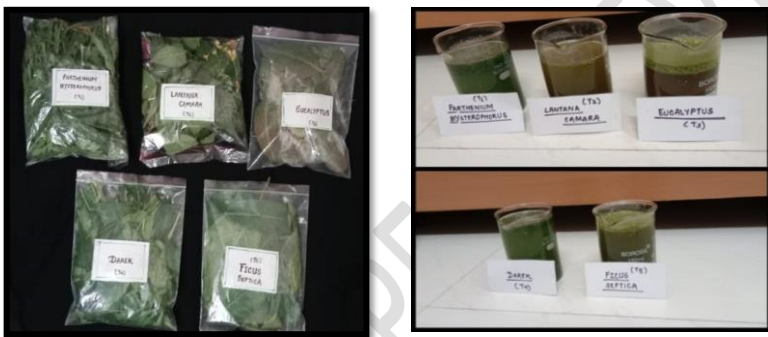
Plate 1 Preparation of plant-extracts for treatments