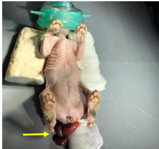
Fig. 2: Positioning of the kitten with prolapsed mass (arrow) in dorsal recumbancy.