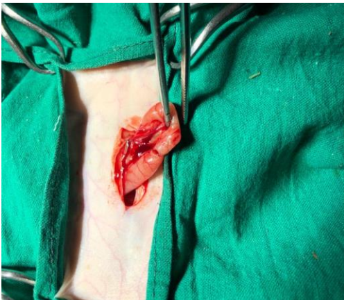
Fig. 3: Perforation on dorsal wall of ileum