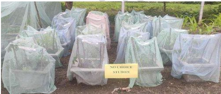
b) No choice

Under no choice test four pots of each host were covered with a nylon mesh cage (Fig. 1b). Five pairs of three day old were inside cages and observed the number of egg masses and number of eggs per mass laid on each host plants till cease of oviposition.