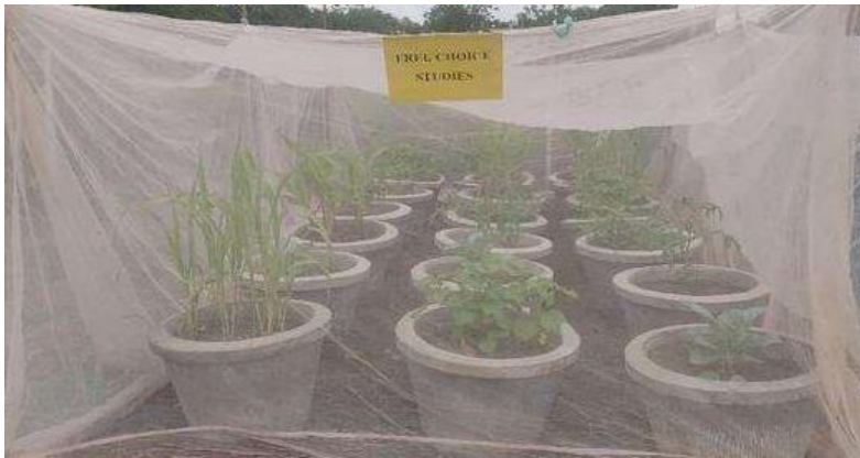
Fig. a) Free choice