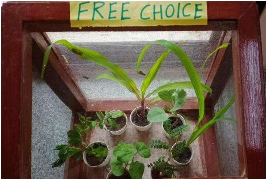
Fig. 2a Oviposition preference studies under laboratory condition with free choice

inside the cages (5:5) under choice condition for egg laying and ten per cent honey solution was provided as food for the adults (Fig. 2a). Observation on number of eggs laid by females under choice.