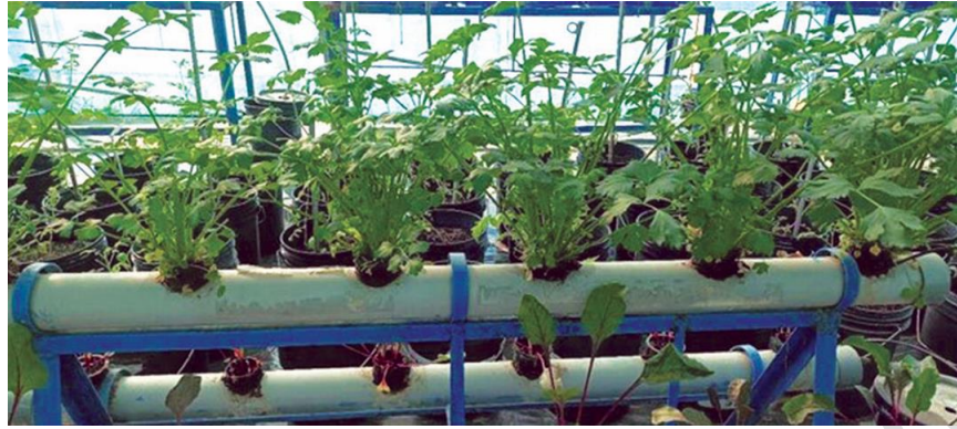
Fig. 3. Celery under hydroponic culture [41]

hydroponics and conventional systems. The results revealed that while the crops in the hydroponic system had a pale yellowish-green color, indicating micronutrient deficiencies, the NFT hydroponic system still produced slightly better crop growth and longer average root lengths than the conventional system [42].