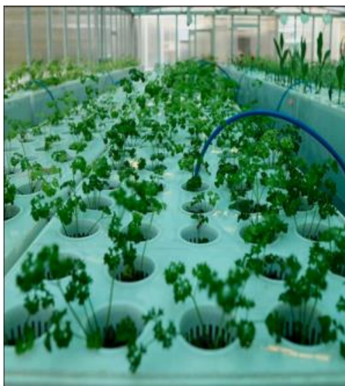
Fig. 5. Parsley in Deep flow technique hydroponic system [48]