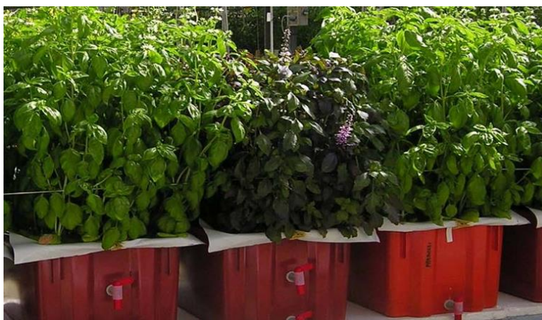
Fig. 6. Hydroponic (Floating system) cultivation of sweet basil [56].

antioxidant content, while beneficial against pathogens and for health, contributed to reduced storability due to oxidation and browning [54]. An experiment compared the development and quality of basil plants grown in NFT hydroponics, Ebb hydroponics and soil-based systems. They found that basil plants produced in NFT Hydroponics had greater growth characteristics, including plant height, root length, leaf length and width, number of leaves per plant, and stem diameter [55].