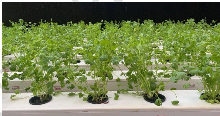
Fig. 4. Coriander grown in NFT hydroponic system

Higher growth and production of coriander in DFT hydroponics were achieved with a recirculation interval of 0.25 hours compared to longer intervals of 12 and 24 hours. Adjusting the recirculation intervals is crucial for maintaining an optimal oxygen supply to the nutrient solution [43]. Two coriander cultivars, Verdao and Tabocas, were grown in both adapted DFT systems using pipes (with depths of 0.02 m and 0.03 m) and conventional DFT systems using wooden tanks (with depths of 0.013, 0.017, and 0.025 m). Results showed that Verdao was more productive, and the smallest nutrient solution depths performed similarly to larger ones, indicating that smaller depths are feasible and contribute to water and fertilizer savings [44]. An experiment demonstrated that varying concentrations of amino acid solutions (0, 100, and 200 ppm) influenced the growth, elemental content, and essential oil composition of hydroponically grown coriander under broad-range red and blue (BRB) light and white light. This amino acid solution rich in aspartic acid and other amino acids, at 100 ppm concentration, particularly under BRB light, led to significant improvements in plant morphology, chlorophyll, carotenoids and the diversity of functional groups. It also promoted the synthesis of more aromatic monoterpenes, highlighting the potential of amino acids to modulate essential oil composition based on specific formulation needs [45].