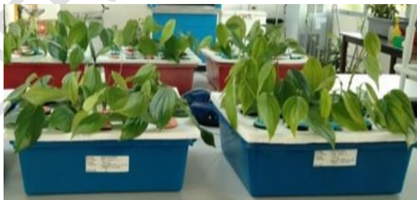
Fig. 2. Hydroponic (Deep water culture) production of high quality rooted cuttings of black pepper [28]

Stem cuttings are the planting material for black pepper; however, soil propagation exposes the stems and developing roots to soil-borne pathogens, which can compromise plant quality. High-quality rooted cuttings supports faster and more effective establishment of black pepper plants. Hydroponic farming provides an excellent platform for producing quality rooted cuttings. A research study evaluated seven nutrient media compositions, finding that Hoagland solution supplemented with potassium silicate at 0.005 mM (T4) and salicylic acid (SA) at 2 mM (T6) promoted faster root growth and initiation. Silicon fertilization plays a regulatory role in nutrient uptake, while SA enhances cellular auxin synthesis at the root tip, aiding the development of adventitious roots. Stem cuttings without roots at planting showed greater increases in root numbers and extension due to their enhanced ability to absorb water and nutrients [28].