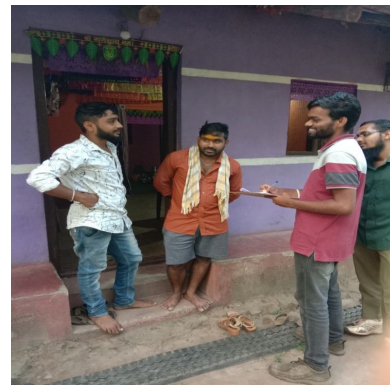
Plate: 2 Questionnaire survey with forest officials and household owners