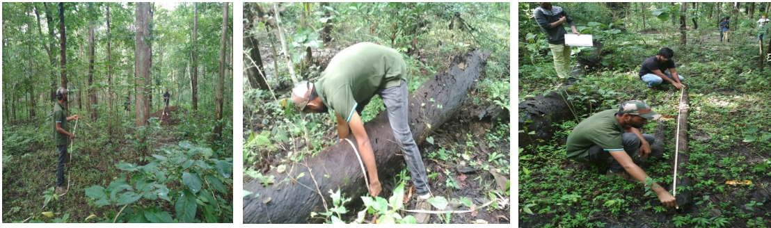
Plate: 1 Lying of plots and recording field observations