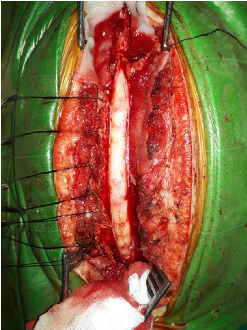
Figure 4 : The intramedullary lipoma was compressing both sides of the nerve roots. Subtotal removal of the lipoma was done as the mass was intermingled with the spinal cord.