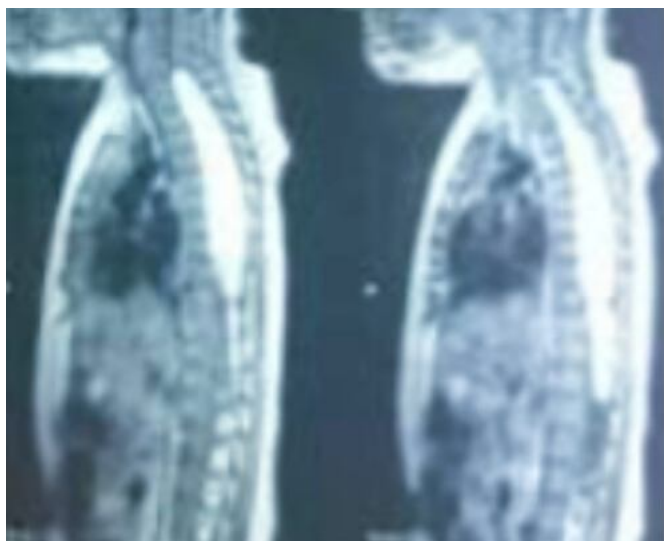
Figure 2: MRI whole spine, sagittal view shows a large well defined fat contained predominantly extramedullary intradural lesion extending from C5 to L1 vertebral level s/o lipoma