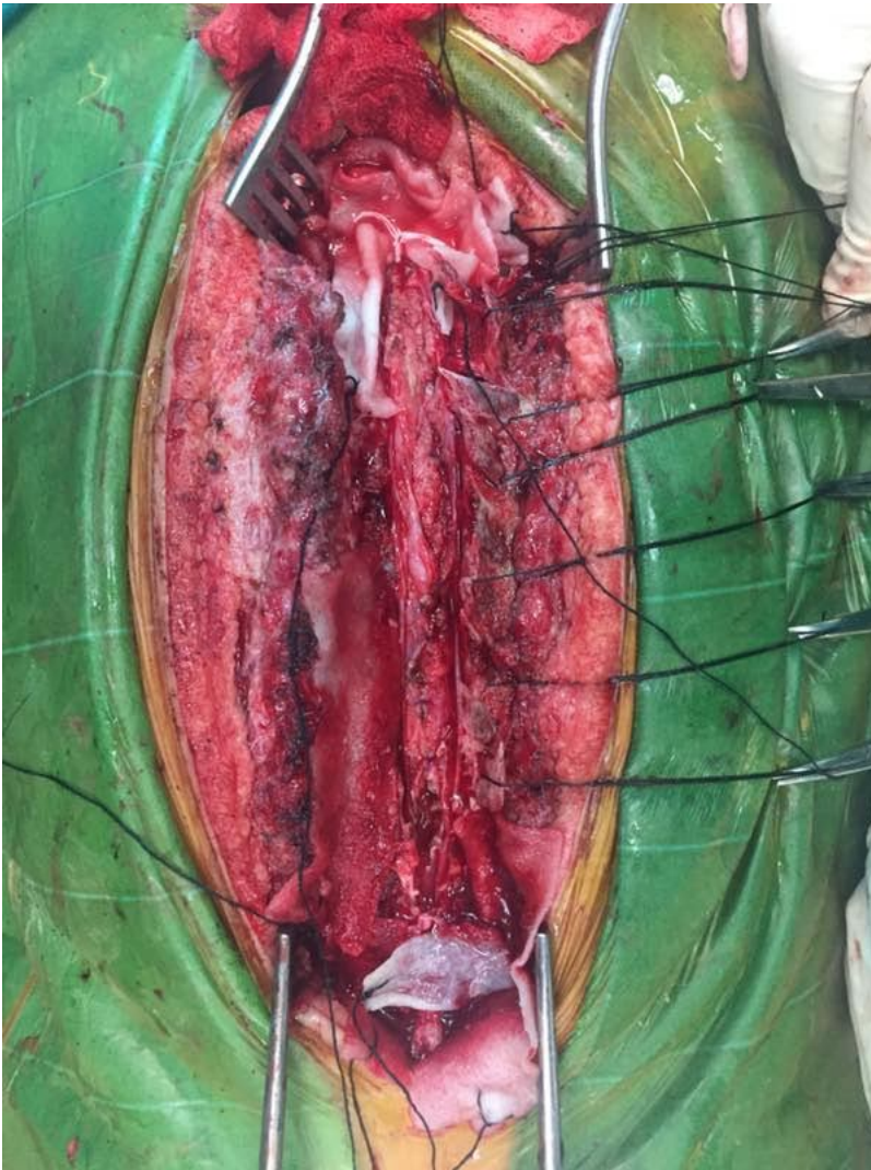
Figure 3 : Posterior midline incision and subperiosteal dissection done to retract and detach paraspinous muscles. Laminectomy of C5, C6 and L1 with laminoplastic laminotomy from C7 to T12 was done. Ligamentum flavum was resected and dura was open for accessing the intradural intramedullary lipoma.