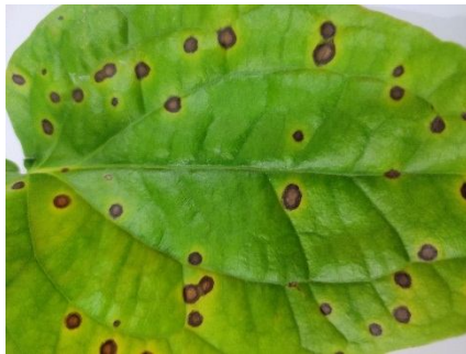
Figure 4. Leaf spot of Chaba