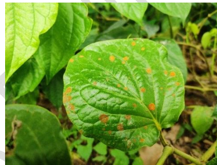
figure 5. Leaf rust of chaba