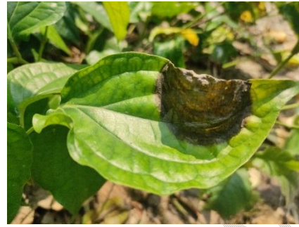
figure 3. Leaf rot of Chaba