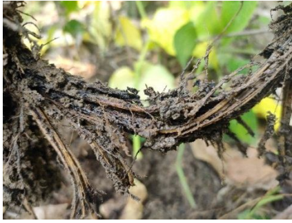
Figure 2. Foot and root rot of Chaba