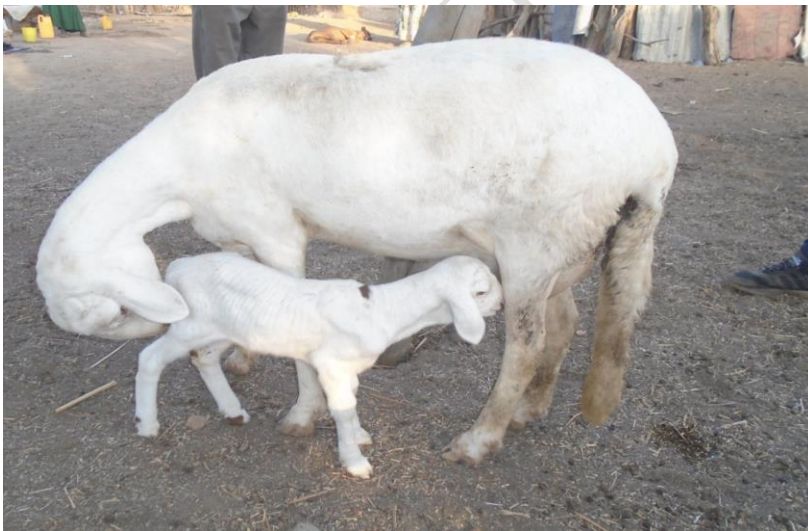
Fig3. Typical Begait ewe