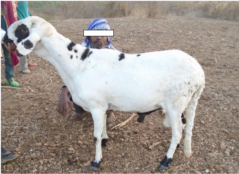
Fig2. Typical Begait ram