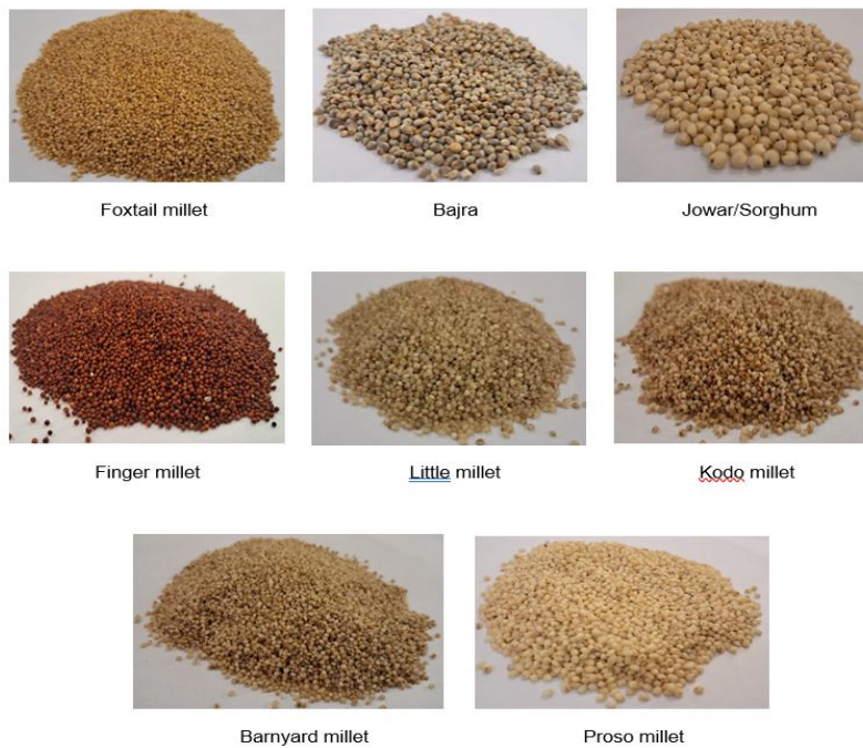
Plate 1. Different types of millets