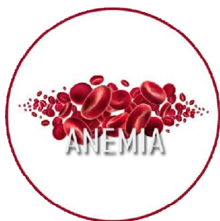
Picture 8 : Health Benefits and Potential for Combating Micronutrient Deficiencies

Mushrooms offer significant potential for combating micronutrient deficiencies, particularly in populations where access to nutrient-rich foods is limited. For rural women, who often face higher nutritional needs during pregnancy and lactation, mushrooms can provide a convenient and affordable way to boost their intake of essential nutrients. In regions where food security is a pressing concern, mushrooms can be cultivated in small spaces, even in adverse environmental conditions, making them an ideal crop for improving local food systems.