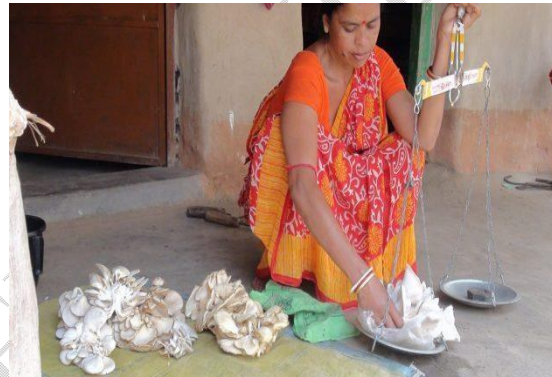
Image2: Village Square

The economic empowerment of rural women through mushroom production also contributes to reducing gender disparities in agriculture. Traditionally, men have dominated agricultural activities in many rural areas, with women playing supportive roles. However, mushroom cultivation provides an opportunity for women to take ownership of an agricultural activity that is relatively low-cost, lowlabor, and highly profitable. By gaining control over this segment of agriculture, women can challenge traditional gender roles and become more active participants in the rural economy. In many cases, women's cooperatives have formed around mushroom production, further enhancing their bargaining power and access to markets (FAO, 2019). Reducing gender disparities and promoting economic independence through mushroom production also have broader implications for rural development. When women are economically empowered, they are more likely to invest in their children's education and healthcare, leading to long-term improvements in the well-being of future generations. Furthermore, financially independent women are better positioned to participate in community decision-making processes, advocating for policies and initiatives that benefit their families and communities.