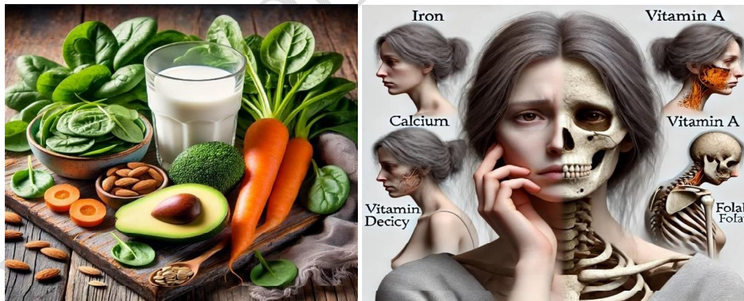
Picture 2 : Sources & Deficiencies of Iron, Calcium, Vitamin A & Folate Iron, Calcium, Vitamin A & Folate

Beyond the biological challenges, the socio-cultural context in which rural women live significantly influences their nutritional status. Gender disparities in access to food, education, healthcare, and income are widespread in many rural communities, particularly in low-income countries. In many households, women often prioritize the nutritional needs of their children and male family members over their own, resulting in inadequate food intake for themselves. Cultural practices and traditional