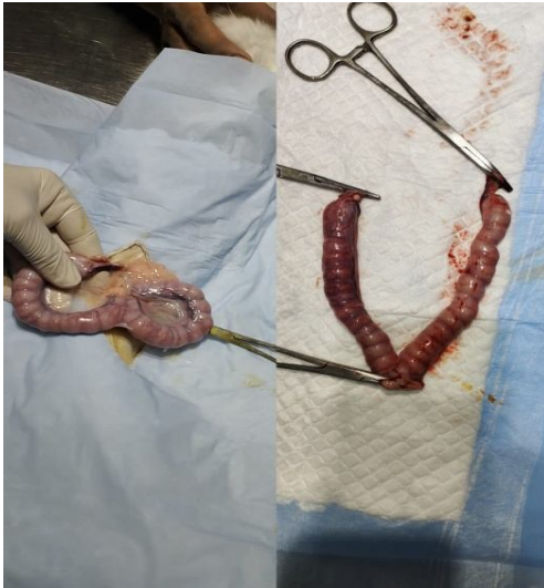
Fig 3: Queen pyometra uterus

4.Conclusion: By the outcomes of the present study, we can conclude that Ovariohysterectomy is the best method for treating chronic pyometra in queens.