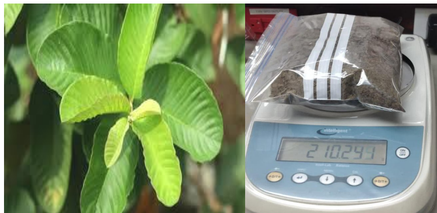
Fig. 1 Psidium guajava leaves