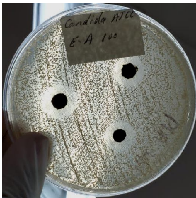
Fig.4. ZOI of P. guajava leaf ethyl acetate extract against C. albicans ATCC at 100 mg/mL concentration.