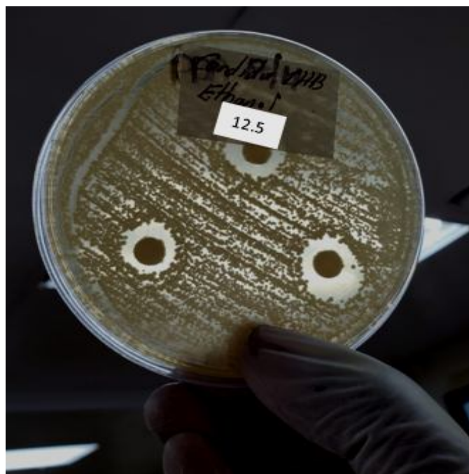
Fig.6. ZOI of P. guajava ethanolic extracts against C. albicans In-house B at 12.5 mg/mL concentration.