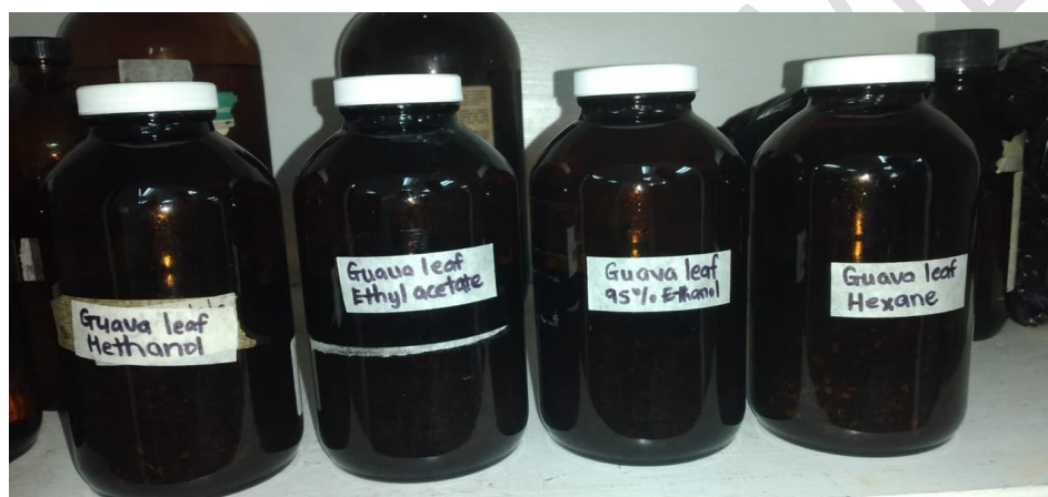
Fig. 3. Maceration of ground leaves with different solvents.