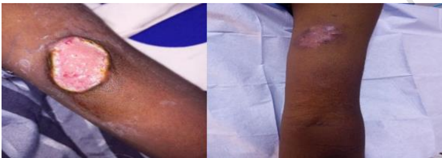
Figure 1: Ulcerated lesion on the anterior aspect of the left thoracic limb at diagnosis and after 02 months of anti-tuberculosis treatment

Commented [6]: Mention total months of TB treatment WHO guidelines/ your country guidelines for cutaneous TB