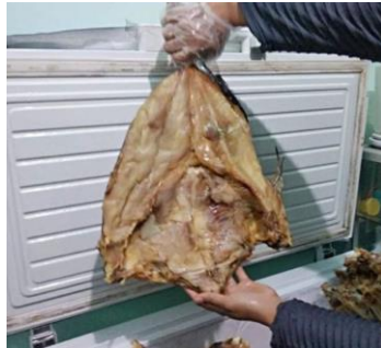
Figure 2. Chest Freezer Storage