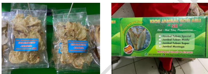
Fig 6. Packaging Development Innovation

Along with the development of time, packaging design is not only protective, but also an artistic value that illustrates product features, persuades consumers, product philosophy, and so on. Creative packaging can also be used as a marketing strategy and product brand reinforcement. Xxx The marketing aspect plays a very important role. Products that are favored by consumers, the right pricing, the right selection of locations and distribution channels, and the right promotion will be able to improve business performance in terms of marketing and turnover.