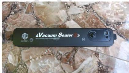
Figure 3. Vacuum

Kiosk SR, known as a producer and seller of jambal roti from manyung fish, initially did not utilize vacuum packaging and sealer technology in its operations. The jambal roti products produced are conventionally packaged, which is less than optimal in maintaining the quality and freshness of the salted fish during distribution and storage. Without vacuum packaging, the risk of quality degradation due to air, moisture, and bacterial contamination is higher, which can affect the taste, texture, and durability of the product. Along with the development of market needs and increasing awareness of the importance of food product quality standards, Kiosk SR then began to switch to vacuum packaging and sealer technology. The development of packaging technology for salted jambal roti fish products in SR MSMEs using vacuum and sealer methods has shown great potential in improving product quality and shelf life. Vacuum packaging is effective in inhibiting bacterial growth, because vacuum conditions reduce the growth of aerobic bacteria, thereby minimizing changes in odor, taste, and appearance of the product (Maherawati et al. 2023). In addition, the use of sealers provides additional protection against contamination and mechanical damage during distribution (Ariyetti et al. 2022). With this innovation, SR MSMEs can not only extend product shelf life, but also increase competitiveness in the processed food market, while answering consumer needs for practical and high-quality products.