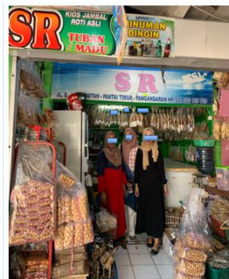
Figure 1. Kios Jambal Roti SR