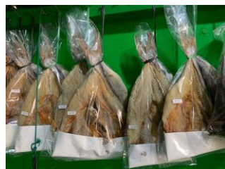
Fig 5. Initial Packaging