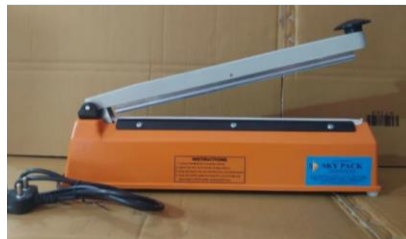
Figure 4. Sealer