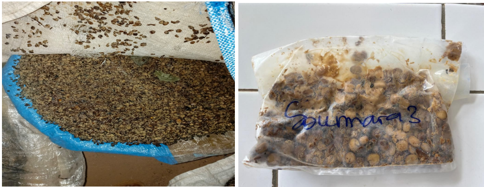
A B Fig 1: Fermentation of néré seeds (A) and soumbara (B)