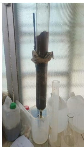
Image 4 Filter Column set up for Vetiver

Commented [h6]: The figures are repetitions so better to make it one figure and explain it