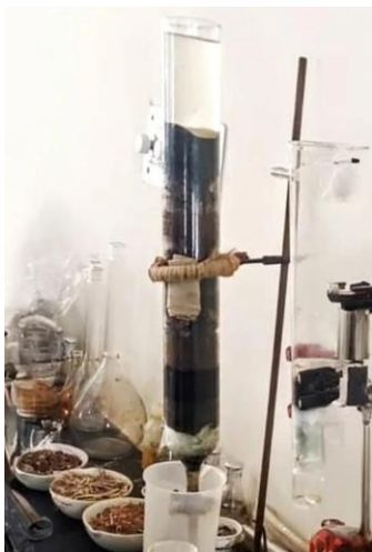
Image 1 Filter Column set up for Sawdust

Commented [h5]: The figure must be mentioned in the text