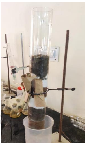
Image 2 Filter Column set up for Limestone