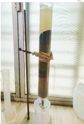
Image 3 Filter Column set up for Neem Leaf powder