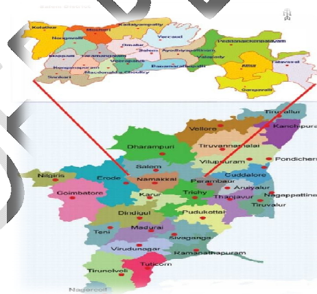
Fig. 1. Location map of the study area (Salem district) adapted from Ref. [15]

The Central Soil Salinity Research Institute (CSSRI) in Karnal evaluated groundwater samples for irrigation suitability using EC, SAR, and RSC values (see Table 1) [18]. On the basis of the CSSRI water quality classification, thematic maps of groundwater quality in Salem district were created with ArcGIS software. The ArcGIS Geostatistical Analyst technique was used to generate various thematic maps, and ArcGIS Spatial Analyst was used to produce the final groundwater quality map. The inverse distance weighting (IDW) interpolation technique was employed to determine the spatial distribution of groundwater quality parameters [19].