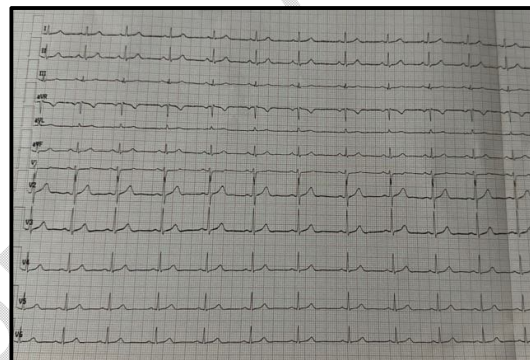
Figure 2: ECG taken a few hours later, showing resolution of the Brugada pattern.

The patient remained clinically stable, with regression of the brugada pattern a few hours after admission.