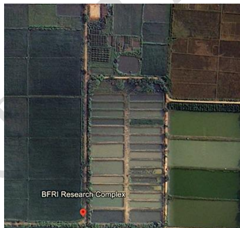
Figure 1: Polyculture earthen ponds of Freshwater Station, Bangladesh Fisheries Research Institute (BFRl), Mymeningh, Bangladesh location (24 0 72'06"N, 90 0 42'04"E). The image was extracted from Google Earth and illustrated by Arc GIS (Version 2.2)

The experiment was carried out for a period of 6 months from February 2023 to July 2023 in earthen ponds located at the Freshwater Station of Bangladesh Fisheries Research Institute, Mymeningh, Bangladesh (Figure 1).