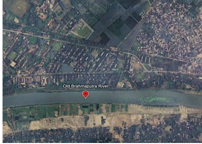
Figure 2: Collection point of studied fishes, old Brahmaputra River, Mymensingh, Bangladesh (24°72'85"N, 90°43'87"E). Image were extracted from Google earth and illustrated by Arc GIS (Version 2.2)