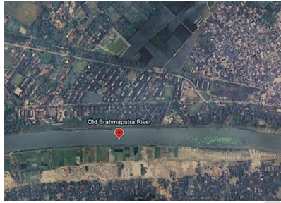
Figure 2: Collection point of studied fishes, old Brahmaputra River, Mymensingh, Bangladesh (24 o 72'85"N, 90 o 43'87"E). Image-Images were extracted from Google earth-Earth and illustrated by Arc GIS (Version 2.2)