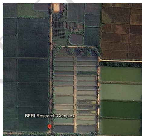
Figure 1: Polyculture earthen ponds of Freshwater Station, Bangladesh Fisheries Research Institute (BFRl), Mymeningh, Bangladesh location (24 0 72'06"N, 90 0 42'04"E). Image was extracted from Google earth and illustrated by Arc GIS (Version 2.2)

The experiment was carried out for a period of 6 months from February 2023 to July 2023 in earthen ponds located at Freshwater Station of Bangladesh Fisheries Research Institute, Mymeningh, Bangladesh (Figure 1).