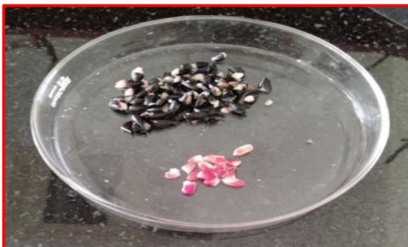
Figure 4: Data recording of purple-coloured seeds as viable and non-coloured seeds as non-viable seeds of Melia dubia