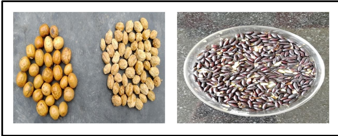
Figure 2. Extracted drupes from fruits after removing pulp and extracted seeds or kernels from the dried drupes of Melia dubia