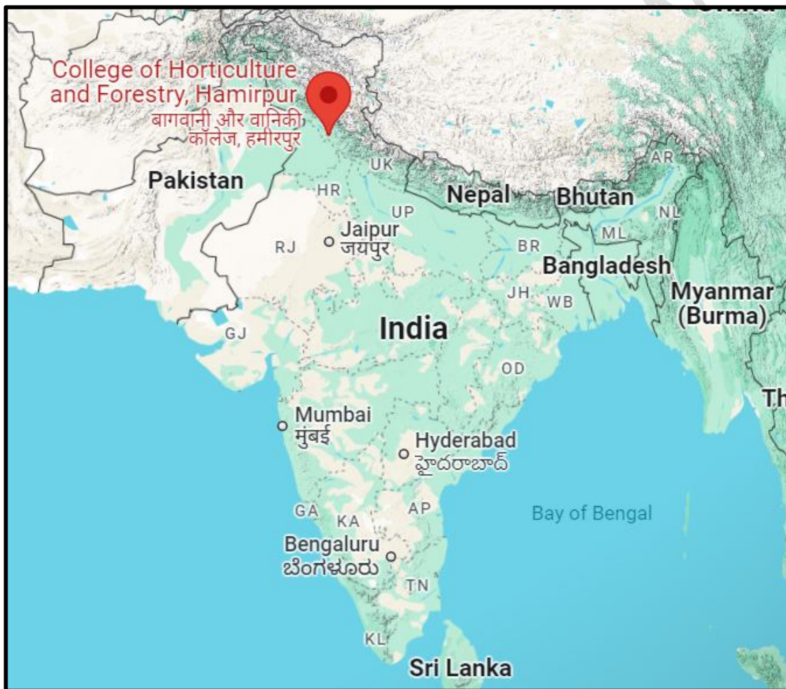
Figure 1. Geolocation of fruit collection of Melia dubia for the present research study

Fruits of Malabar Neem tree was collected from the experimental farm of forestry, College of Horticulture and Forestry, Neri, Hamirpur, Himachal Pradesh, India during the year of 2024 at latitude (31.695790 N), longitude (76.4677291 E) and altitude (620 m from MSL) as geolocation presented in Figure 1. The recorded data of mother tree were recorded and presented in Table 1. After the collection of fruits, they were sun dried for 2-3 days so that the fruit pulp gets dried and removed. This process is known as depulping. The pulp removed and then seeds (kernels) were extracted from the drupes (Figure 2). Then, seeds exposed for surface sterilization and dried, this is known as seed drying. Further, kernels were mixed thoroughly to maintain homogeneity in the seed lot as per ISTA rules [28].