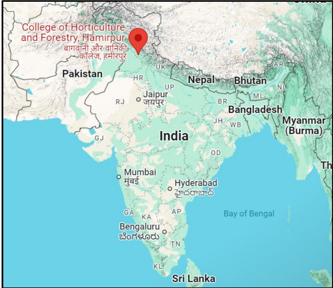
Figure 1. Geolocation of fruit collection of Melia dubia for the present research study

Drupes of Malabar Neem tree was collected from the experimental farm of forestry, College of Horticulture and Forestry, Neri, Hamirpur, Himachal Pradesh, India during the year of 2024 as geolocation presented in figure 1. The recorded data of mother tree were recorded and presented in Table 1. After the collection of fruits, they were sun dried for 2-3 days so that the fruit pulp gets dried and removed. The pulp removed and then seeds (kernels) were extracted from the drupes (figure 2). Further, kernels were mixed thoroughly to maintain homogeneity in the seed lot.