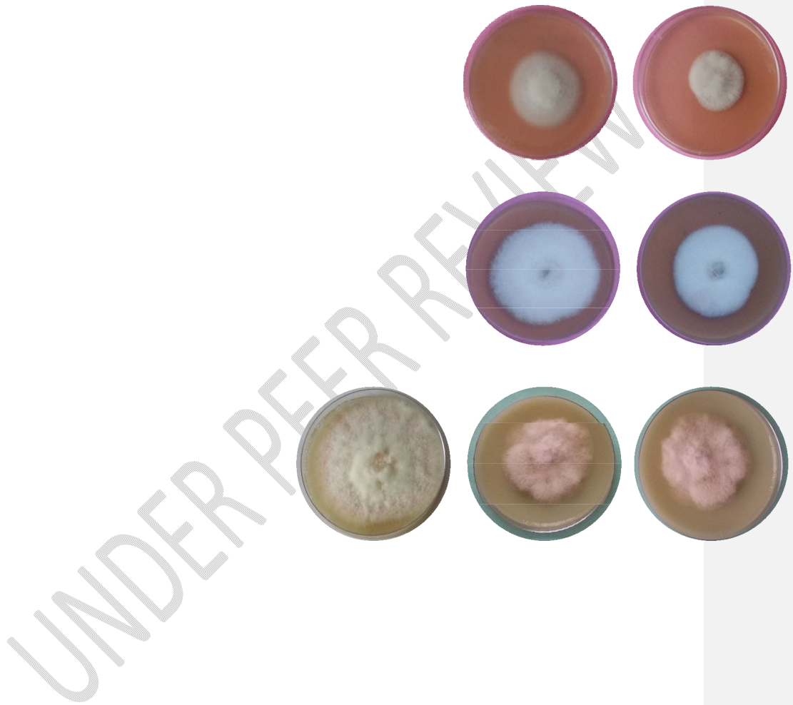
Plate 1: Evaluation of different organic formulations against Fusarium oxysporum f.sp. radicis-cucumerinum in vitro condition