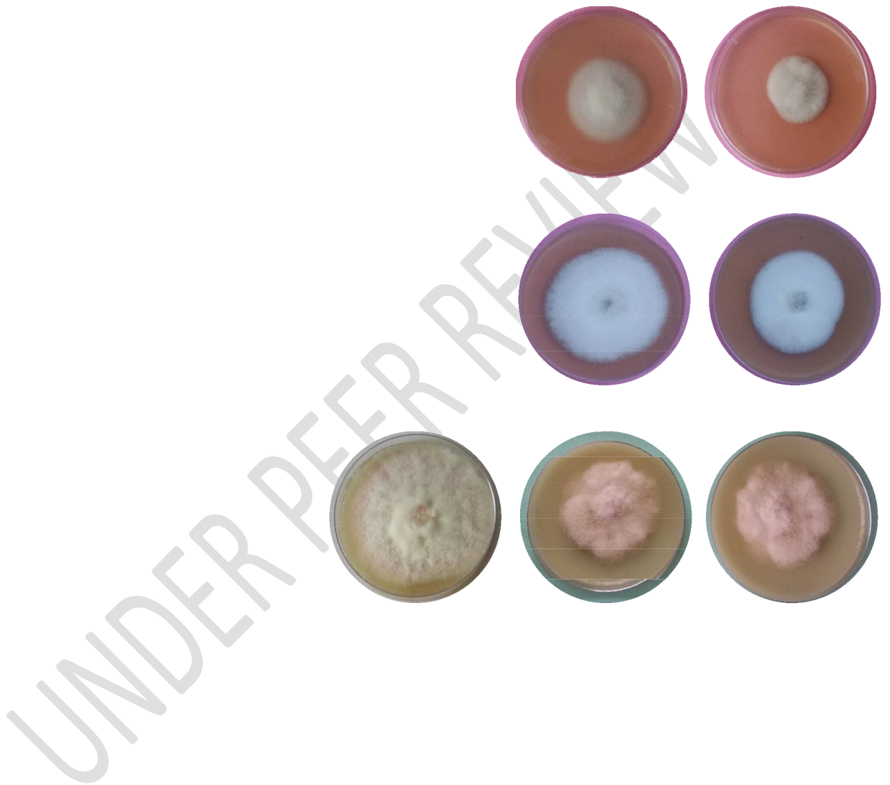
Plate 1: Evaluation of different organic formulations against Fusarium oxysporum f.sp. radicis-cucumerinum in vitro condition