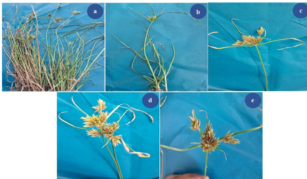
Figure 2: Vegetative and reproductive stage (a & b), flowering and fruiting of Cyperus rotundus L. (c, d & e)