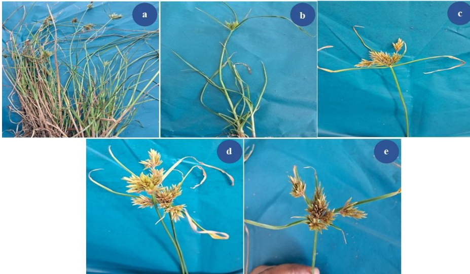
Figure 2: Vegetative and reproductive stage (a & b), flowering and fruiting of Cyperus rotundus L. (c, d & e)