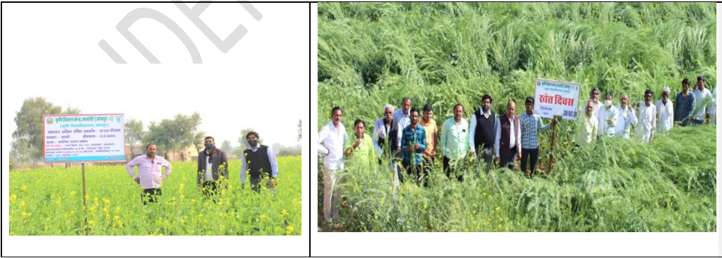
Fig 2. Performance of mustard variety RH-0749 under demonstration in Jodhpur district of Rajasthan