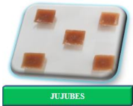
Fig 3. Value added products from wood apple (Jujube)