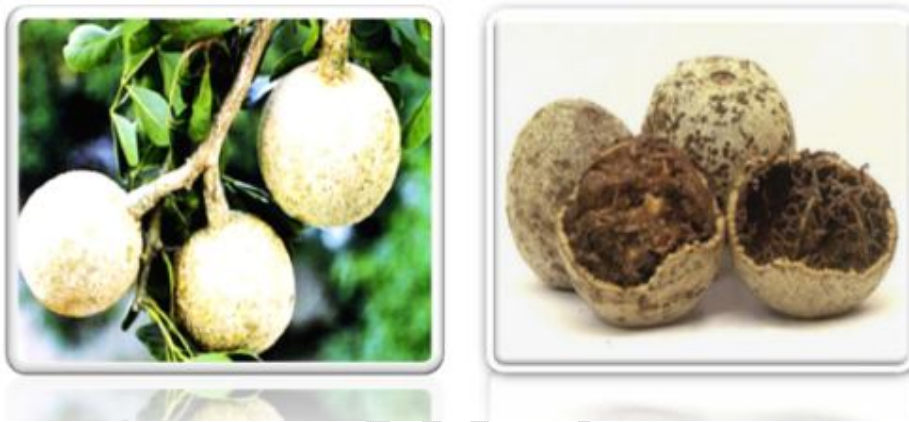
Fig 1 wood apple fruit

Jellies and gummies are extremely popular among children under 17 because of their natural and chewy texture, as noted by Moloughney in 2011. These products are made up of a gel-like composition that consists of at least 45g of fruit per 100g, as well as sugars in the form of sucrose syrup and/or glucose, at concentrations of around 55g per 100g. Additionally, they contain gelling agents, acids, flavours, and colours as indicated by Cappa et al. in 2015 and Mutlu et al. in 2018.